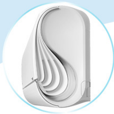
Elegant S-curved design